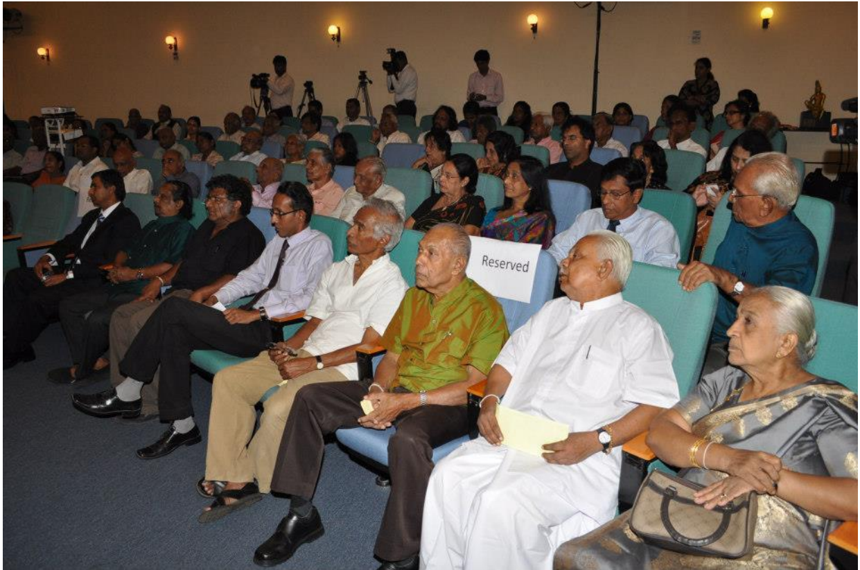
9 May Shri Geeth – An evening of songs to commemorate Talat Mehmood