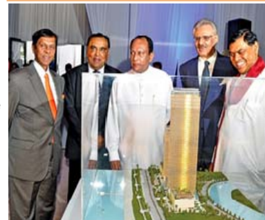
Groundbreaking ceremony of the 'ITC Colombo One' project 19 November 2014